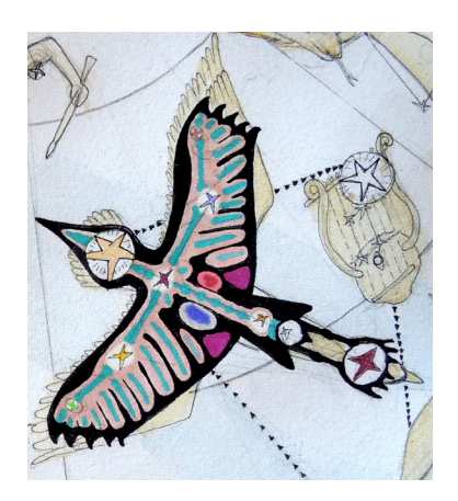
Figure 5. Close up of Ajiijaak/Bineshi Okanin – Crane/Skeleton Bird constellation

Ajiijaak/Bineshi Okanin - Crane/Skeleton Bird - Cygnus