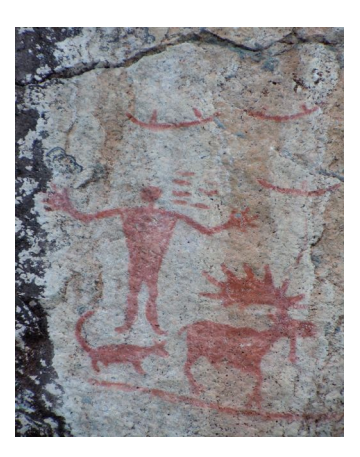
Figure 1. Pictographs at Lake Hegman.