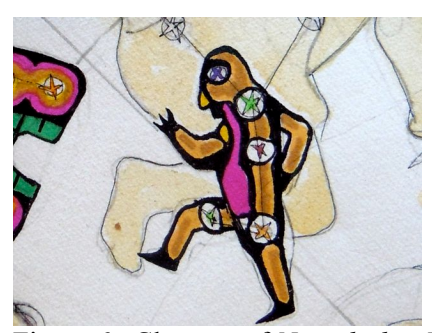
Figure 6. Close up of Noondeshin Bemaadizid – Exhausted Bather constellation

summertime. Cranes can grow almost as tall as a person, with wingspans longer than most people. It is one of the tallest birds in the world and can fly very high.