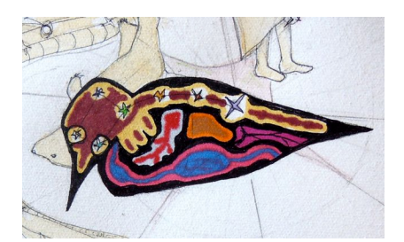
Figure 11. Close up of Maang – Loon constellation