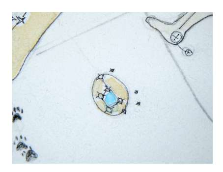
Figure 9. Close up of Bugonagiizhig – Hole in the Sky constellation

This constellation is an animal of the Ojibwe clan system. The moose provides food, clothing, and shelter for the people, much like deer or caribou. Compared to a deer, moose are much bigger and spend a lot of time in the water, especially in summer. Male moose have a 'beard' of skin under their chin that can be seen in the constellation.