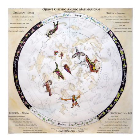
Figure 2. Ojibwe Giizhig Anung Masinaaigan – Ojibwe Sky Star Map created by Annette S. Lee, William Wilson, Carl Gawboy

The border includes: strawberries, raspberries, blueberries and winterberries illustrated in reference to traditional Ojibwe style floral beadwork. Often the floral beadwork is done on black velvet or with a white beadwork background. Usually beadwork is done on items of importance spiritually or socially like pipe bags, moccasins, leggings, etc.