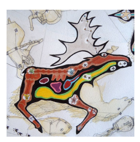
Figure 8. Close up of Mooz – Moose constellation