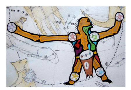
Figure 10. Close up of Biboonkeonini – Wintermaker constellation