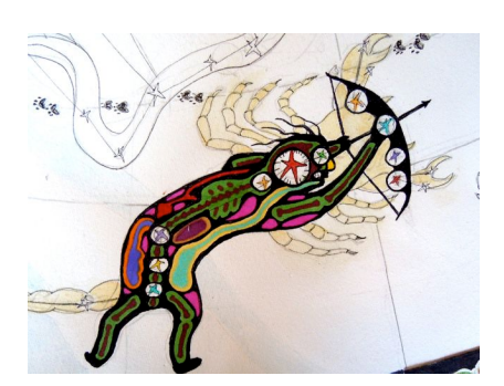
Figure 7. Close up of Nanaboujou – Nanaboujou constellation

The sweat lodge is a purification ceremony. The person is physically exhausted after participating in the sweat, but full of life and renewed on the inside. The Exhausted Bather is an early summer constellation.