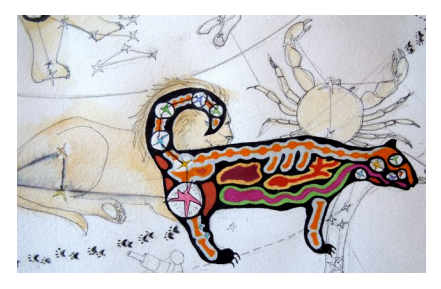
Figure 3. Close up of Mishi Bizhiw – Curly Tail constellation